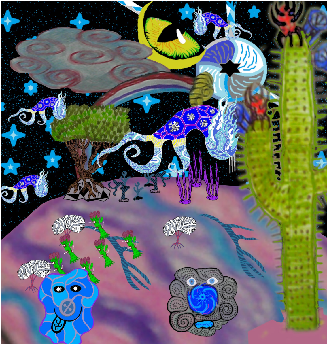
The Desert of Pink Glass (Night)