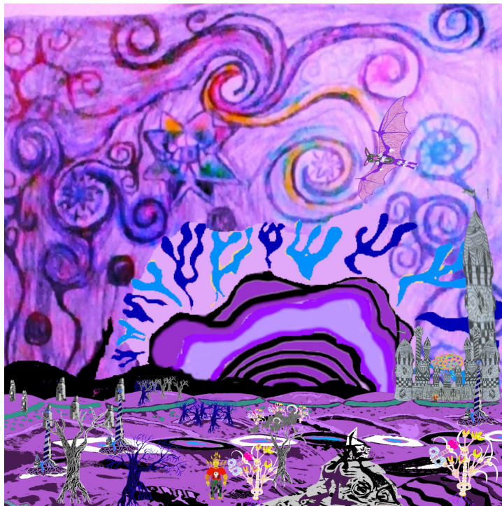
The Land of the Black Sun