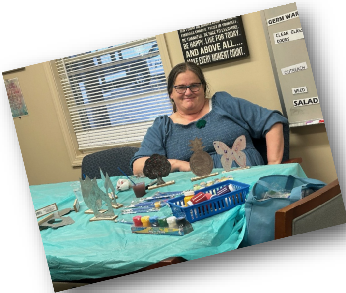
Painting Metal Sculptures