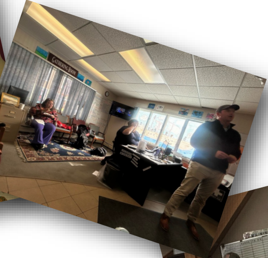
Liberty Bay came to give us a presentation of their Rehabilitation and Recovery program along with pizza!