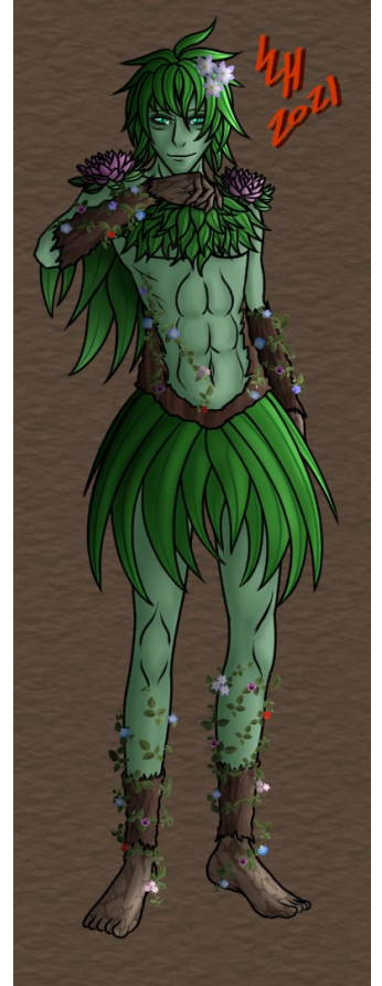
Lotus Original Character by Laura